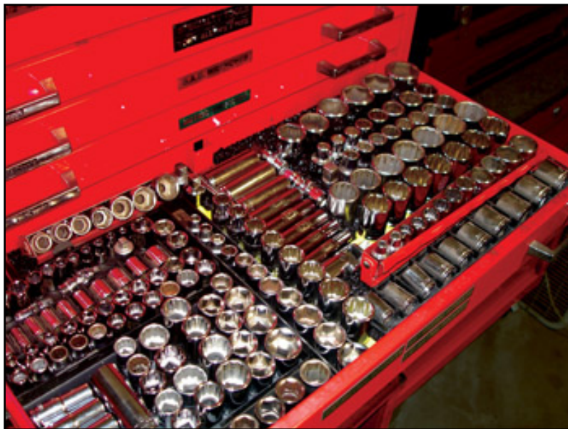
Diagram can be found at: http://www.tractorbynet.com/

Another critical component of any tool set of course are socket sets. Sockets typically are from 1/2 to 1 1/2 inches, and equivalent metric sizes. Socket drives come in 1/4, 3/8, 1/2, 3/4, and one inch drives. Appropriate extensions for each drive, and breaker bars in the same sizes are need as well. The most useful for equipment repair will be the 1/2 and 3/4 inch drive sets.