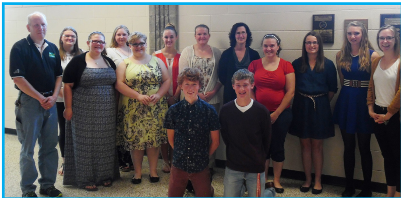
Students and award recipients of the 2016 Youth Philanthropy Council Grants

Chenango Youth Philanthropy Council grants are made possible by collaborations with the Community Foundation for South Central New York, Chobani, and the R.C. Smith Foundation.